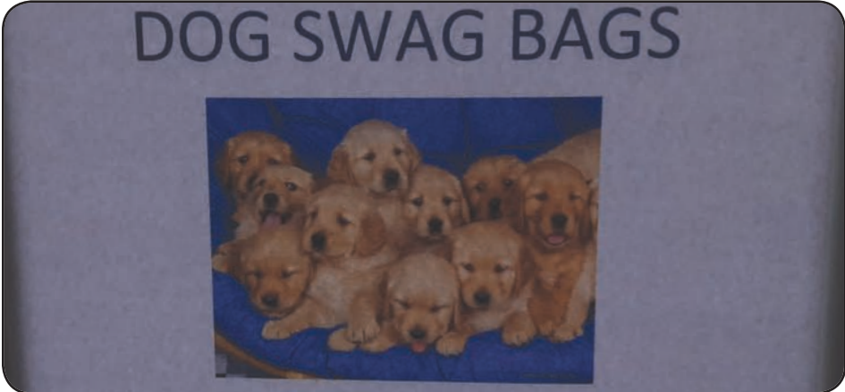
Crossroads is very focused on the care of animals. One of the thoughtful touches at the ribbon cutting were dog and cat swag bags!! All who attended took a fun surprise home to their four legged friends!