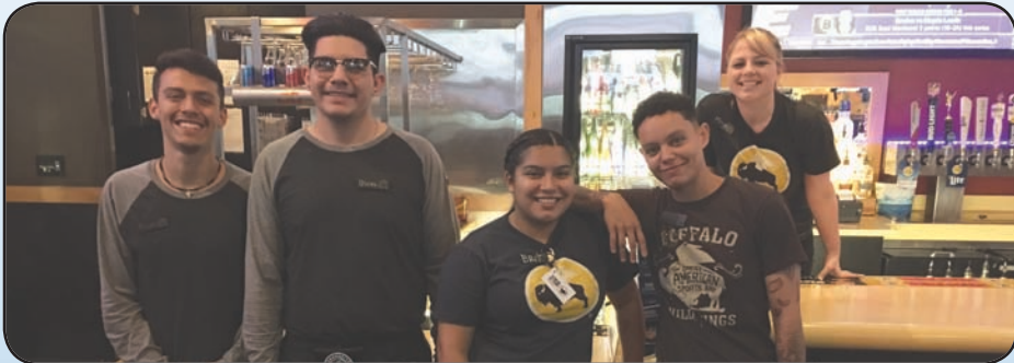
A BIG "Thank You" to the great staff at Buffalo Wild Wings! They did a great job of taking care of our group and made the afternoon fun and delicious!!