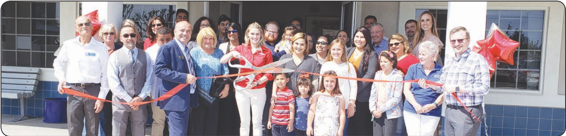
It was a joint effort between the Norwalk and Downey Chambers of Commerce to welcome Crossroads Animal Emergency as a member. Ambassadors and Directors of both Chambers assist with the scissors and the cutting of the ribbon.